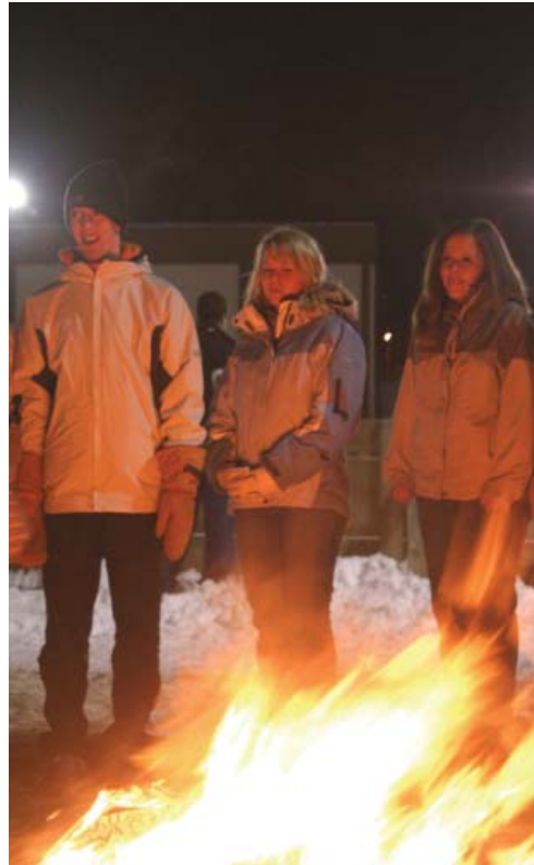
Left: Students warm up by the fire during the Shiny Hockey Tournament at the outdoor rink by the P.E. Centre.