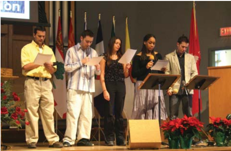
Above: The Student Association officers presented a responsive reading during Opening Convocation.