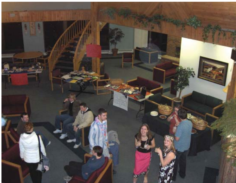
Below: The Student Missions Team displayed tables of photos, cultural items and information in the Lakeview Hall lobby.