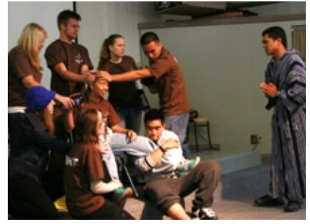
TOP: Students at play. TOP RIGHT: SWAT performing one of their many skits, "Stuck On Sin." RIGHT: Friday evening worship around the fire.